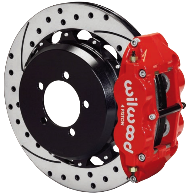
Subaru Brake Kit Assembly, 2008-2012 Shown Download High Resolution Photo, Click Here