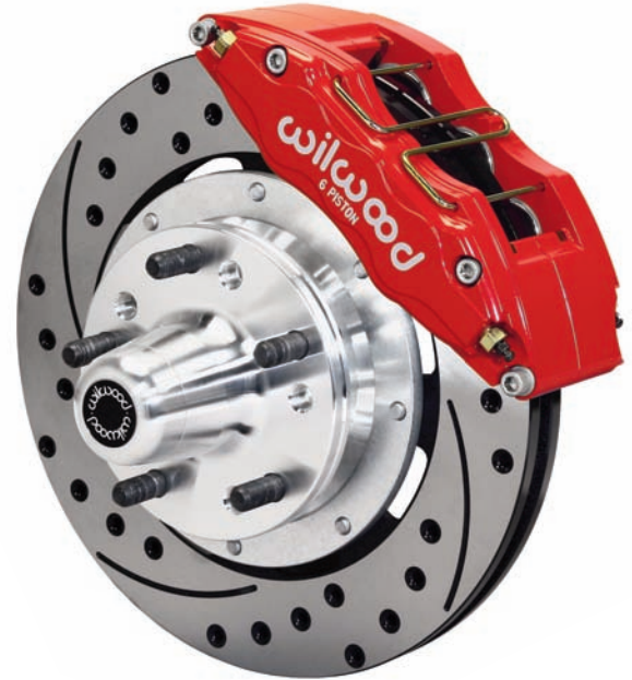
Brake Kit Assembly