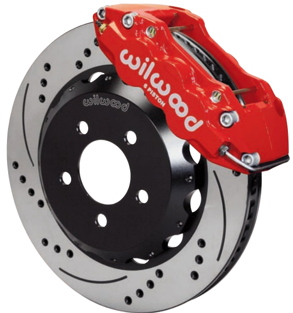
Pontiac Front Kit Assembly