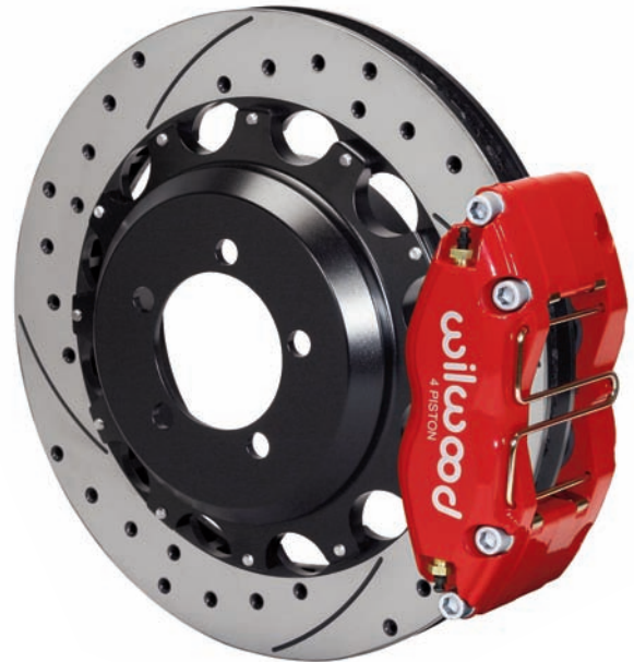
Rear Subaru Brake Kit Assembly Download High Resolution Photo, Click Here