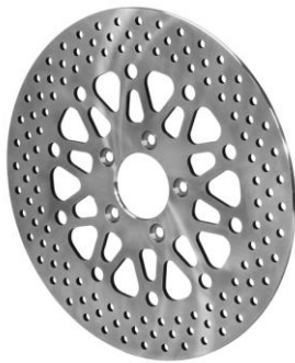
Motorcycle Rotor 160-13355

Wilwood's Satin Series rotors can be used as a direct OE replacement with factory calipers, or can be coupled with Wilwood GP Series calipers for the ultimate combination of all-out stopping power and distinctive show-winning style.