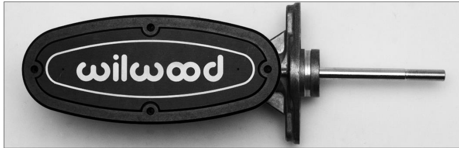
Photo 2. Left side of master cylinder