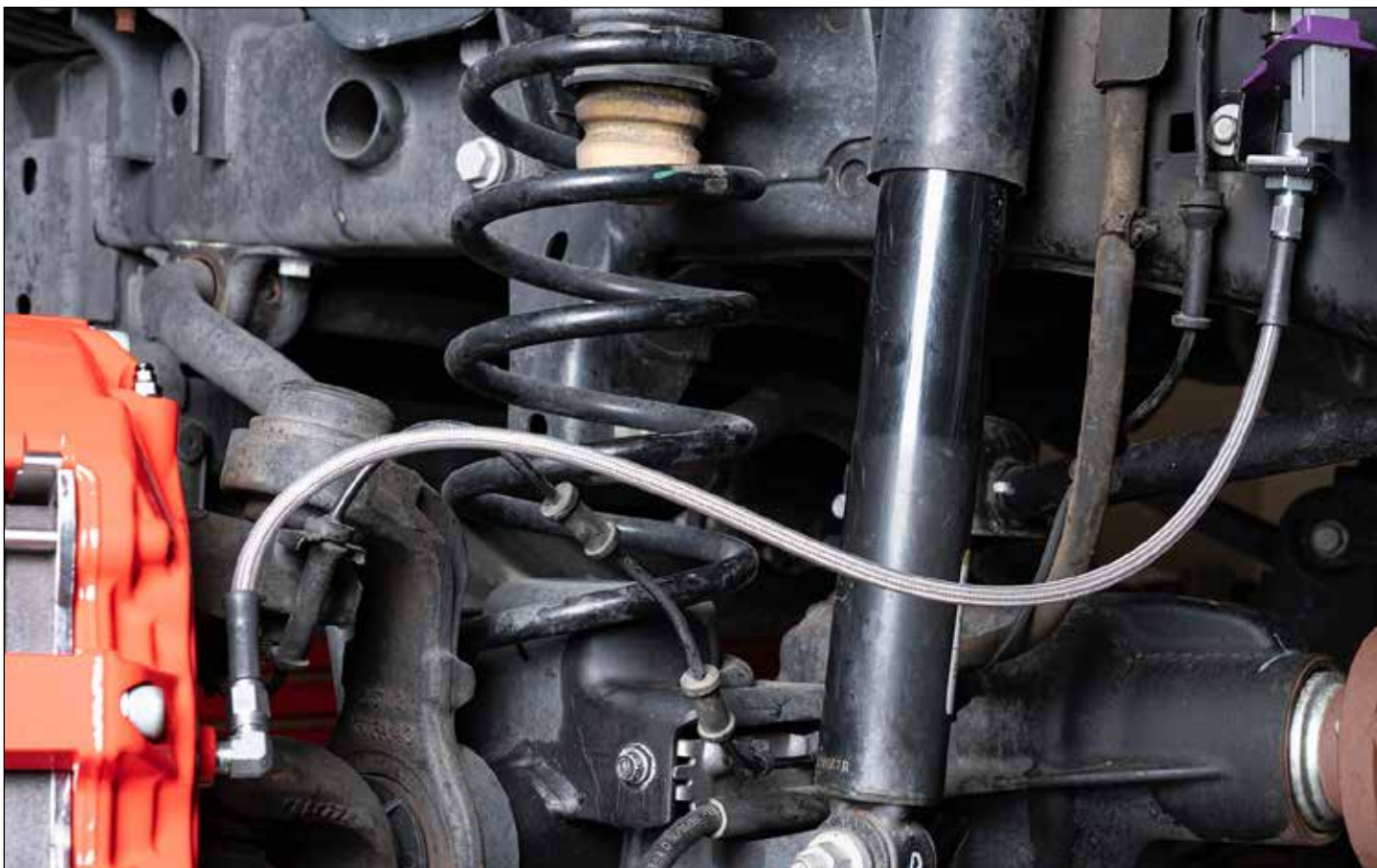
Photo 8b 2007-2018 Jeep JK

STEP 6 Bleed the brake system, referring to the 'Additional Information and Recommendations' on page 7 for proper bleeding instructions. Check system for leaks after bleeding.