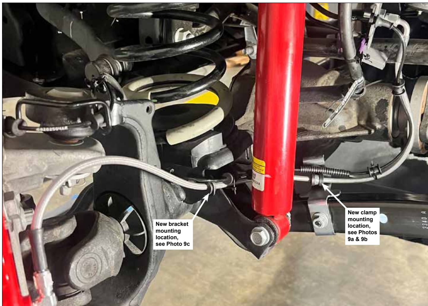
Photo 9d 2018-2025 Jeep JL/JT