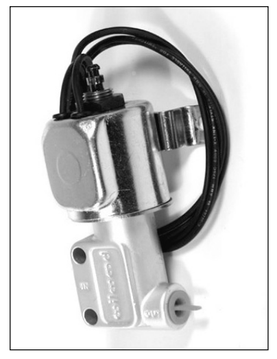
Wilwood's Line Shut-off Valve

Wiring: The lead wires should be connected to a 12 volt, 5 amp (recommended) fused power source through a toggle switch. Always be sure to switch off the power to the line shut-off when the unit is not needed.