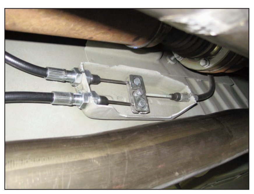
Photo 2 Installation of Cable to Wilwood Combination Parking Brake Caliper Page 3