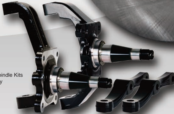
Wilwood ProSpindle Kits Sold Separately

Rotor only Available in 5 x 4.50" Bolt Pattern as Shown