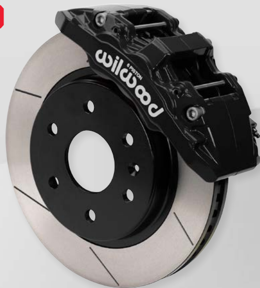
Aero6-DM Six Piston Brake Kit 13.38" GT Slotted Rotor