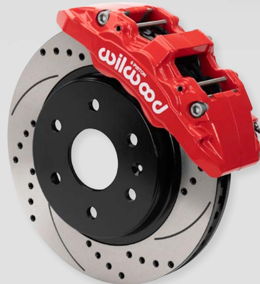
Aero6-DM Six Piston Brake Kit 13.38" SRP Drilled & Slotted Rotor