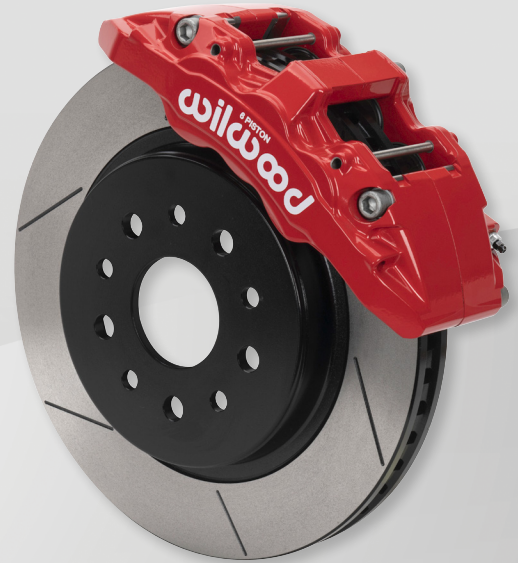
Aero6-DM Six Piston Brake Kit 13.38" GTB Slotted Rotor