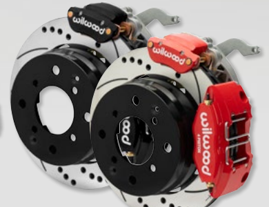
SRP Drilled & Slotted Rotors - Rear with Park Brake

BRAKE KITS ORDERING INFO: PH: 805.388.1188 • FAX: 805.388.4938 • wilwood.com • info@wilwood.com