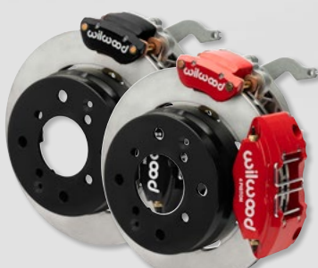
Precision Plain Face Rotors - Rear with Park Brake