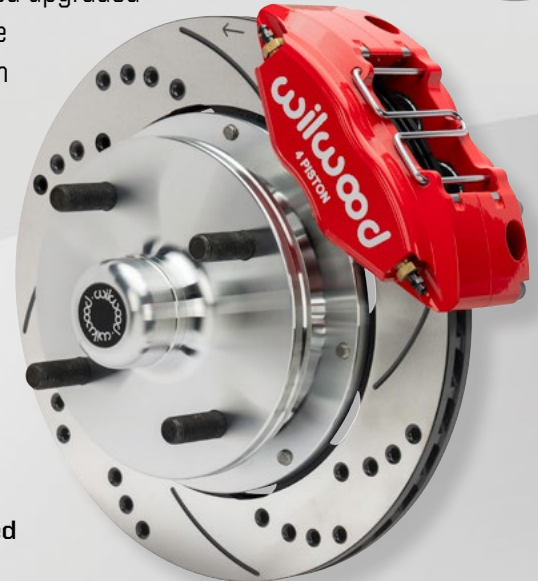
Front, Wheel Studs Included