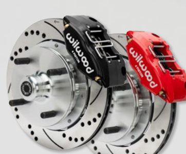
SRP Drilled & Slotted Rotors - Front