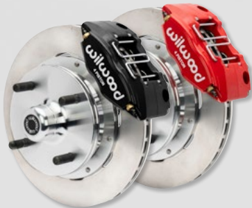
Precision Plain Face Rotors - Front