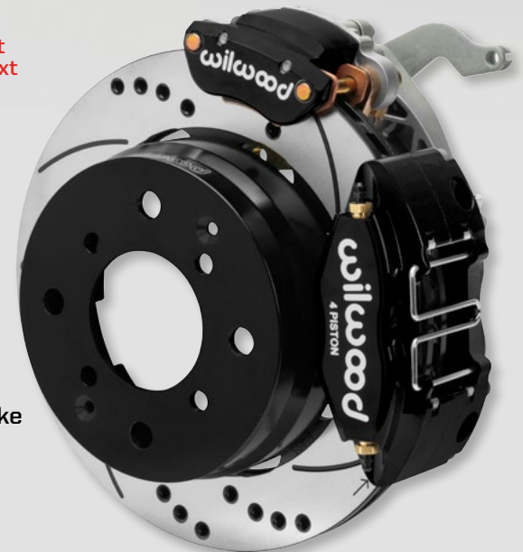
Rear, Park Brake Included