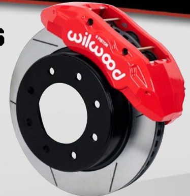
Ford F-250/350 Brake Kit