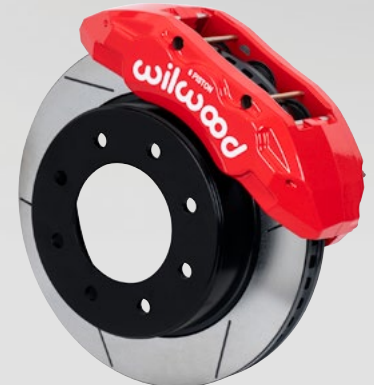
Ram 2500/3500 Brake Kit