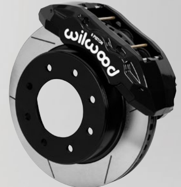
GM 2500/3500 Brake Kit