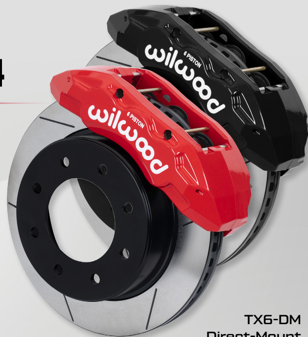
TX6-DM Direct-Mount Front Big Brake Kit