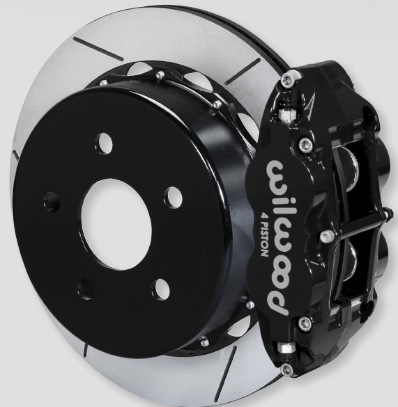
FNSL4R Four Piston Brake Kit 13.50" GTB Slotted Rotor