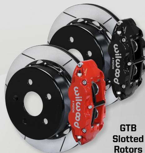
GTB Slotted Rotors

NOTE: BRAIDED STAINLESS STEEL FLEXLINE HOSE KIT NOT SHOWN