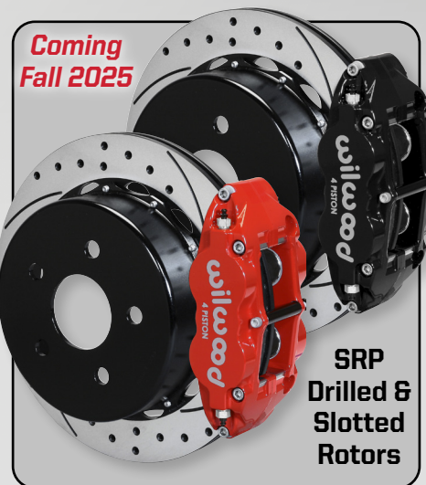
SRP Drilled & Slotted Rotors