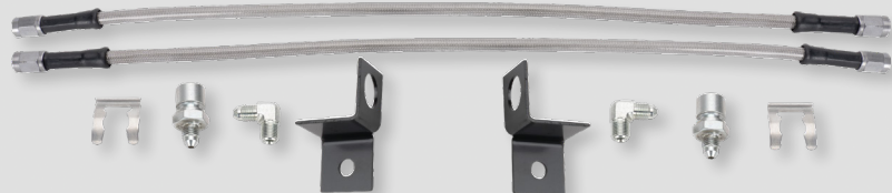
Flexline Kit Specific to Y/M/M

ORDERING INFO: PH: 805.388.1188 • FAX: 805.388.4938 • wilwood.com • info@wilwood.com