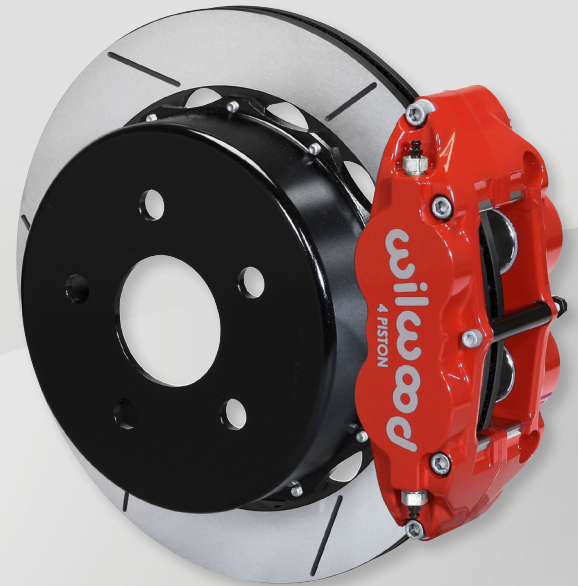
FNSL4R Four Piston Brake Kit 13.50" GTB Slotted Rotor