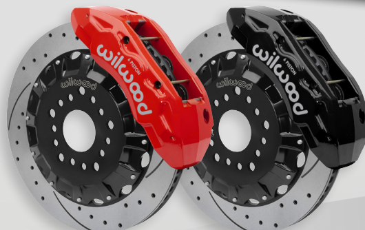
P/N 140-18123-DR SRP Drilled & Slotted