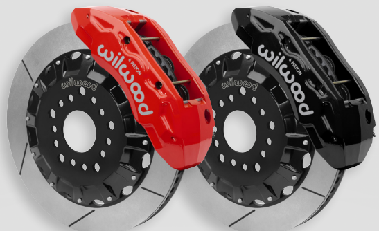
P/N 140-18123-R GTB Slotted Rotor