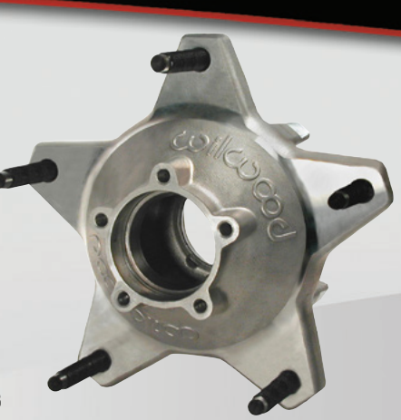
Starlight 55 Rear Hub Long Stud (Bare Finish)

Starlite 55XD Front Hub with Snap Cap (Black E-Coat Finish)