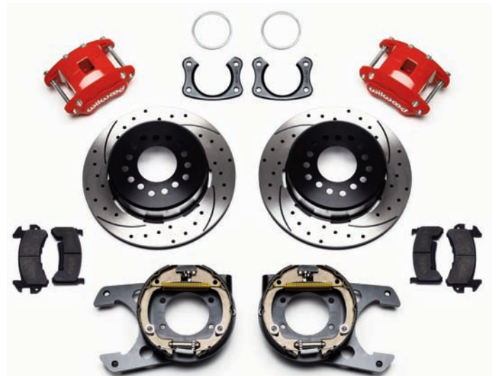
Rear Parking Brake Kit Components with Optional Red Calipers and Drilled Rotors