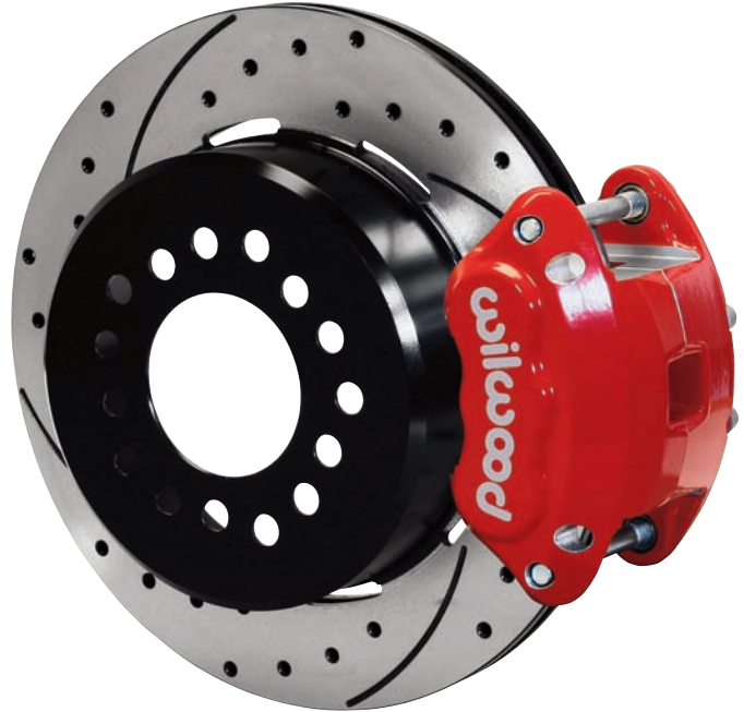
Rear Parking Brake Kit Assembly with Optional Red Caliper and Drilled Rotor

For more information or to obtain high resolution photos for printing, contact: Wilwood's Marketing Department at (805) 388-1188.