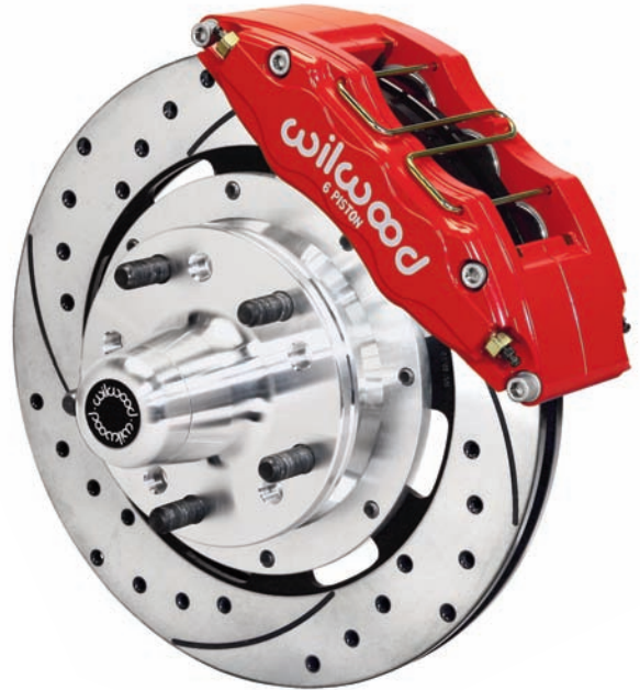
Brake Kit Assembly