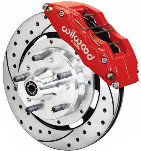
Brake Kit Assembly