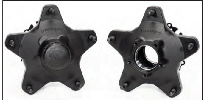
Starlite 55-XD Wide 5 Racing Hub • Front Shown Left, Rear Shown Right ( download high-res photo ) **

230-8454 230-0840 270-6732 270-9498 230-6911