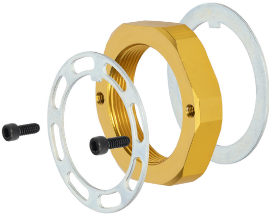
3/4-Ton Spindle Lock Nut Kit

P/N 230-18021 (hi-res photo, click here )